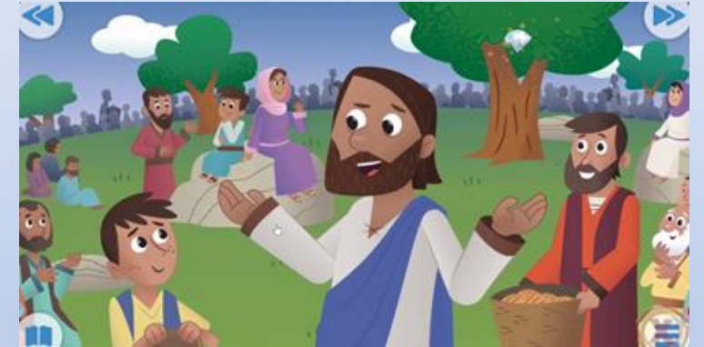
Feeding of the 5000