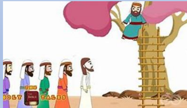
Zacchaeus and Jesus