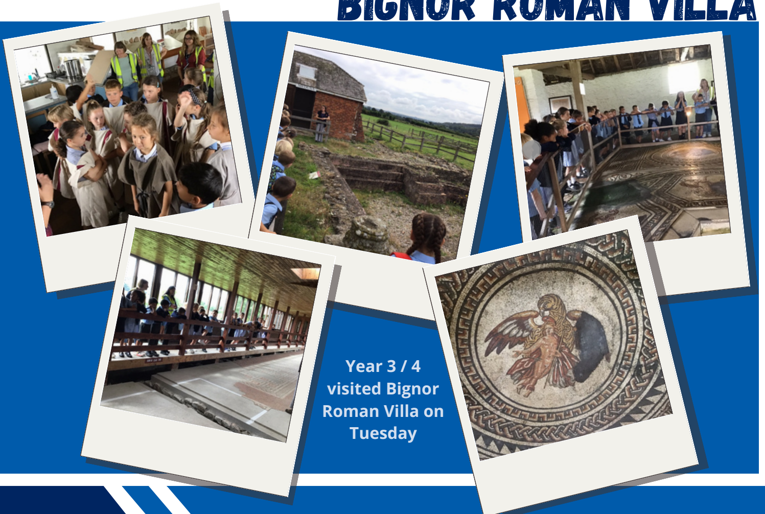
Year 3 / 4 visited Bignor Roman Villa on Tuesday